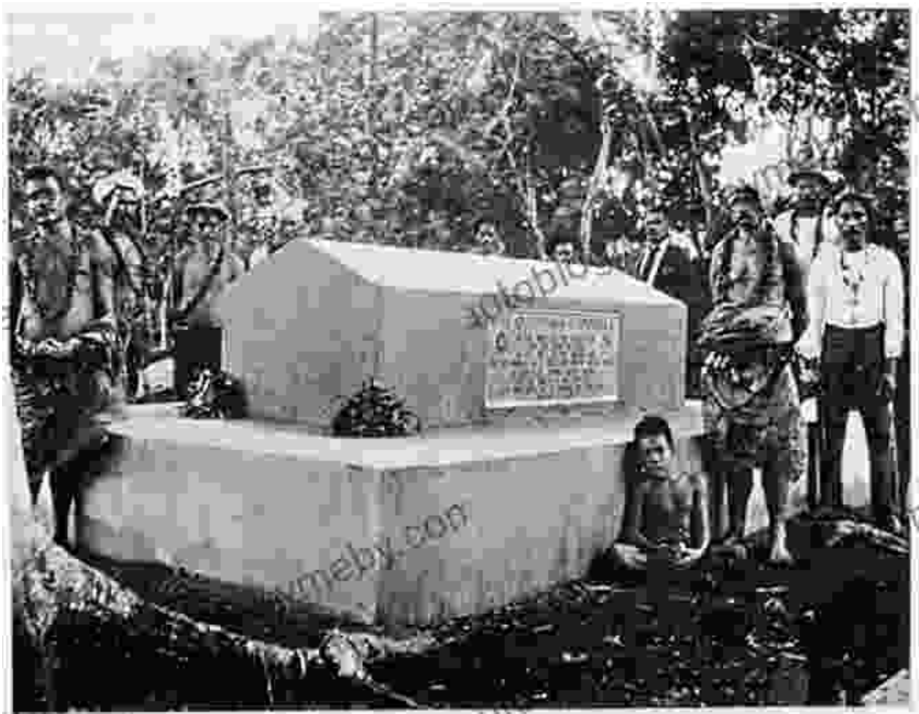
Robert Louis Stevenson, Known as Tusitala in Samoa

Stevenson's writings from Samoa offer a unique blend of adventure, romance, and cultural immersion, reflecting his deep fascination with the island and its people. In The Beach of Falesá , he weaves a captivating story of love, betrayal, and the clash between cultures, while The Ebb-Tide follows the escapades of a group of adventurers as they navigate the perils of the South Pacific.