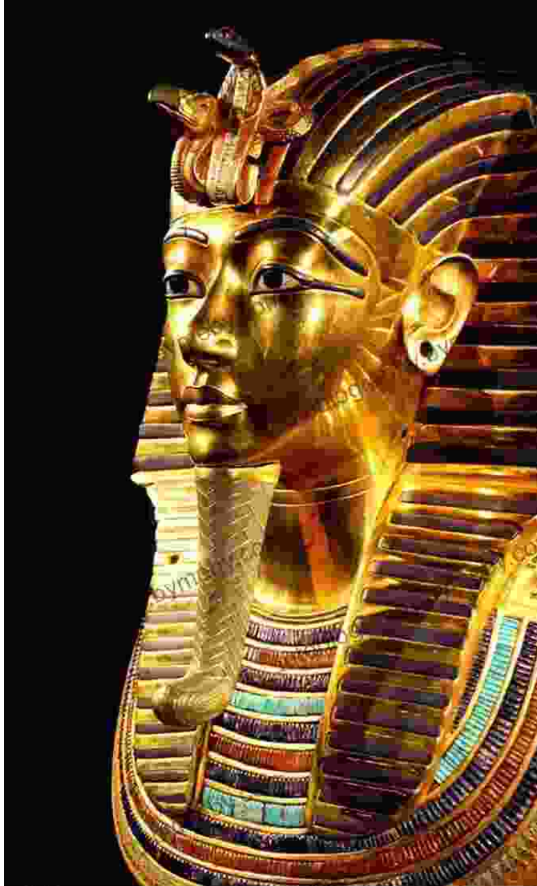
Statue of Tutankhamen

Tutankhamen's tomb is one of the most popular tourist destinations in Egypt. Visitors from all over the world come to see the tomb and its treasures. Tutankhamen's tomb is a reminder of the grandeur and splendor of ancient Egypt.