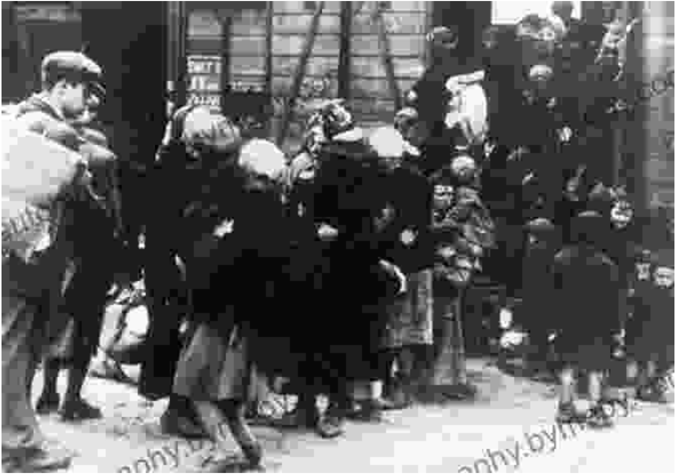
A group of Jewish refugees in New Zealand in 1936