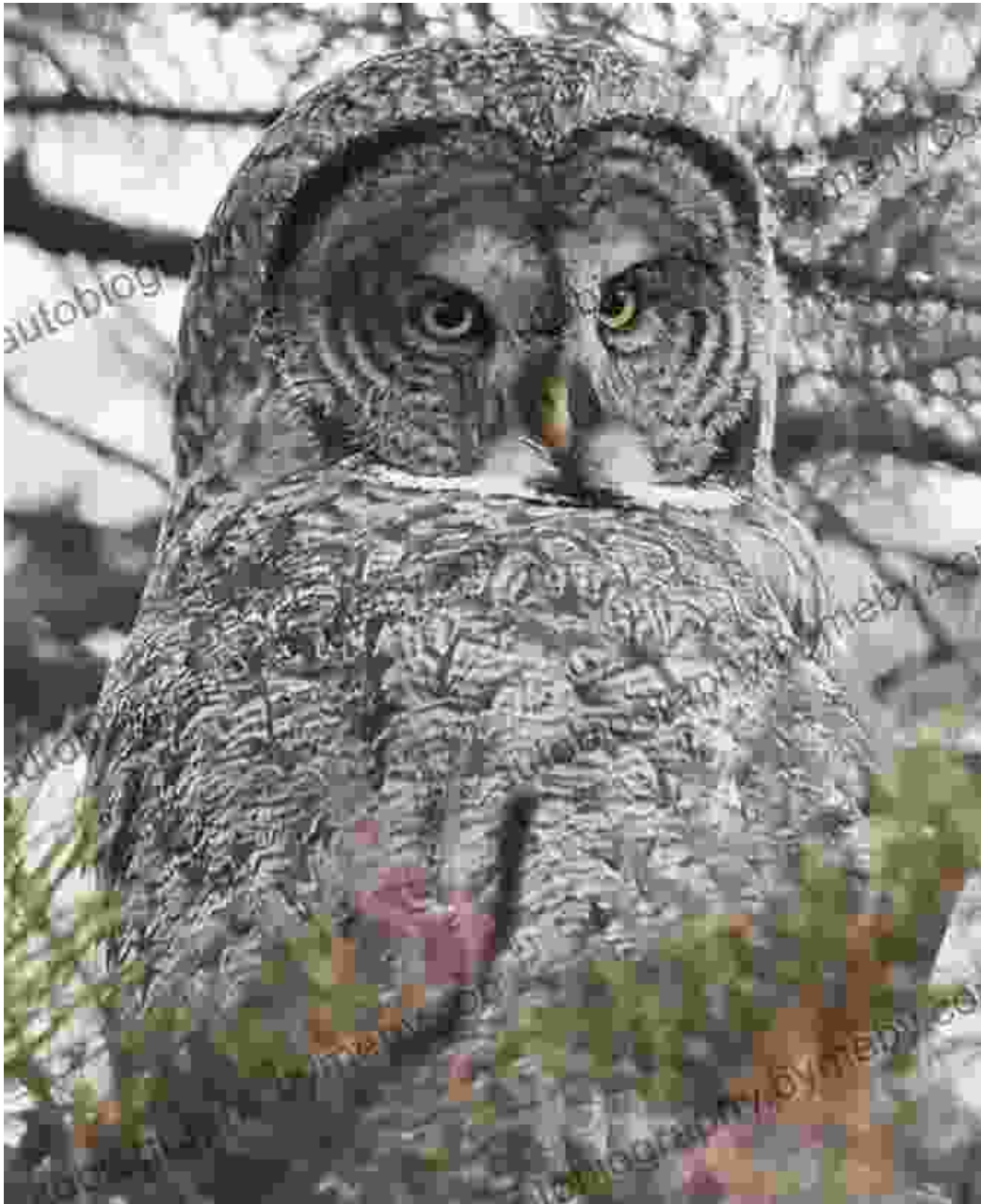
The Enigmatic Figure Behind Grey Owl