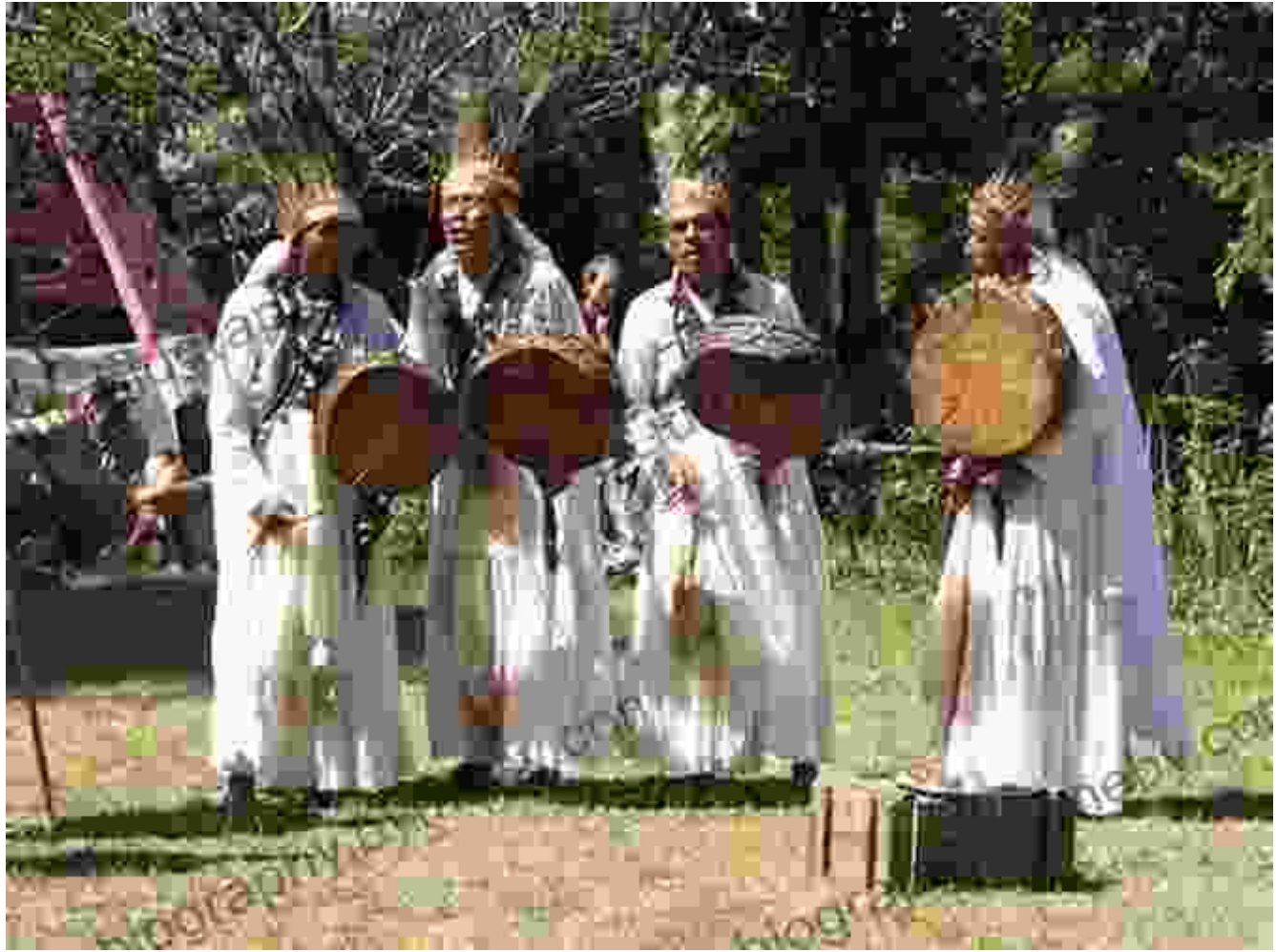
The Origins and Evolution of Magic

Lang's exploration delves into the very origins of magic, tracing its evolution from its primitive roots to its manifestation in modern-day rituals and practices. He argues that magic is an inherent part of human nature, a primal impulse to control the forces of the natural world and shape destiny.