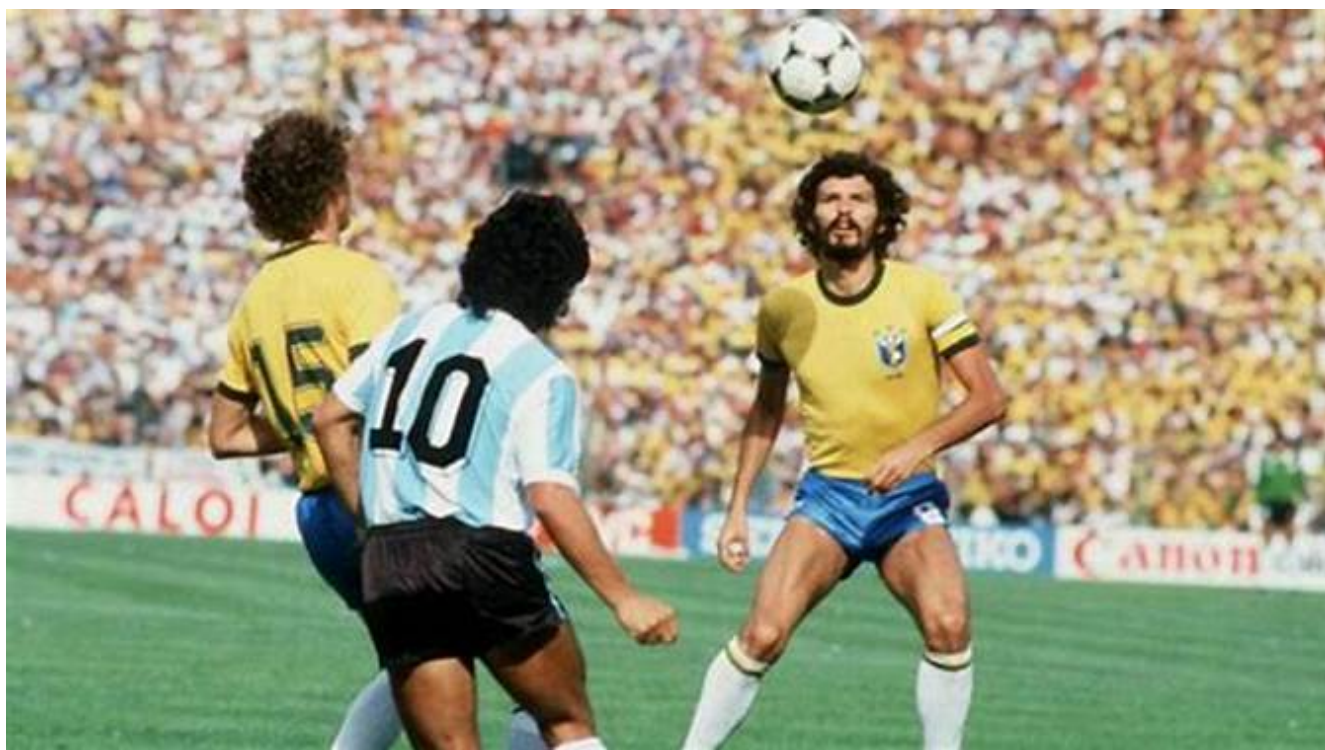
Sócrates playing for Brazil at the 1982 World Cup

Sócrates made his debut for the Brazil national team in 1979. He was a member of the Brazil team that won the 1982 FIFA World Cup. Sócrates scored two goals in the tournament, including a stunning free-kick in the semi-final against Italy. He was also named to the All-Star Team of the tournament.